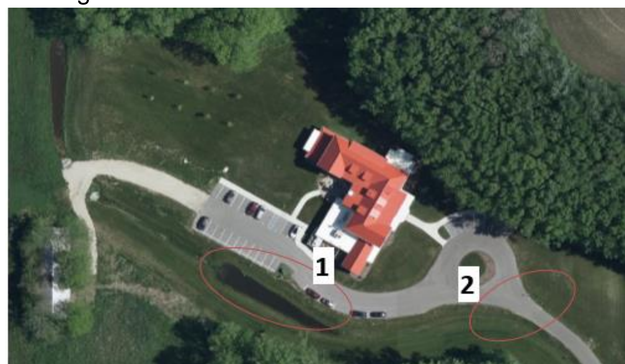
Figure 1. Whittaker Inn stormwater issues